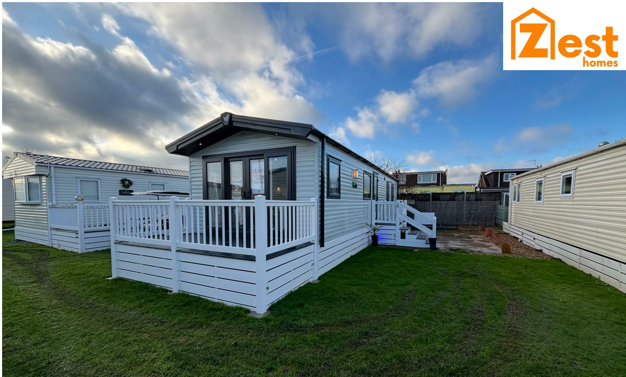
Seaview Holiday Park St John's Road, Whitstable, CT5 2RY £84,995